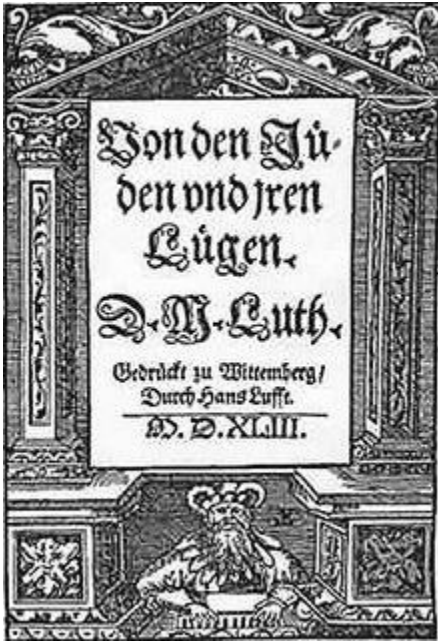
Bookcover of On the Jews and Their Lies 1543

In his pamphlet On the Jews and Their Lies Martin Luther advocates an eight-point plan to get rid of the Jews as a distinct group either by religious conversion or by expulsion: