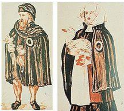
Jews from Worms, Germany wear the mandatory yellow badge . A moneybag and garlic in the hands are an antisemitic stereotype (sixteenth-century drawing).