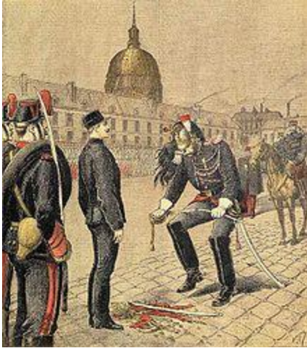
The treason conviction of Alfred Dreyfus .

Speech of Pope Pius IX in regard to Jews: "of these dogs, there are too many of them at present in Rome, and we hear them howling in the streets, and they are disturbing us in all places."