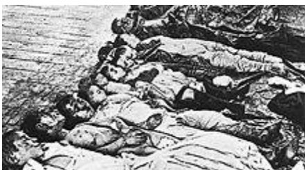
The victims of a 1905 pogrom in Dnipropetrovsk .

In the late nineteenth and early twentieth centuries, the Roman Catholic Church adhered to a distinction between "good antisemitism" and "bad antisemitism". The "bad" kind promoted hatred of Jews because of their descent. This was considered un-Christian because the Christian message was intended for all of humanity regardless of ethnicity; anyone could become a Christian. The "good" kind criticized alleged Jewish conspiracies to control newspapers, banks, and other institutions, to care only about accumulation of wealth, etc. Many Catholic bishops wrote articles criticizing Jews on such grounds, and, when accused of promoting hatred of Jews, would remind people that they condemned the "bad" kind of antisemitism. [19]