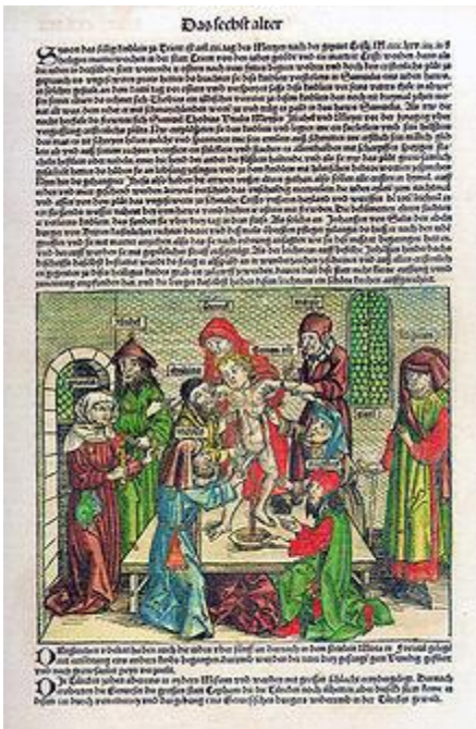
Simon of Trent blood libel . Illustration in Hartmann Schedel's Weltchronik ,