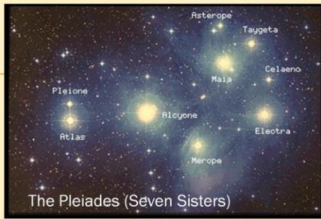
The Pleiades (Seven Sisters)